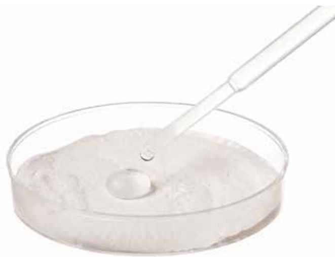
Competitor calcium sulfate—repels liquid