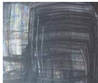
Competitor calcium sulfate