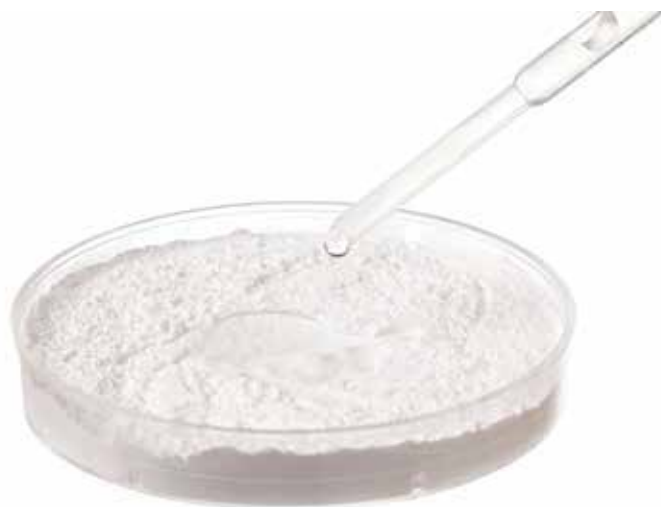
STIMULAN—mixes with liquid